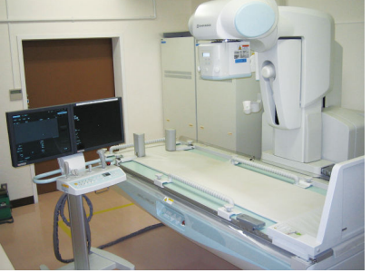
Fig. 3 SONIALVISION G4

the visibility of subtle, pale contrast of contrast media as well as the increasing employment of endoscopy for various purposes and increasing use of fluoroscopic recording for swallowing imaging. High-definition fluoroscopic images have also become an effective tool for recognizing subtle lesion changes during stomach radiography examinations and enema examinations. Improvements in fluoroscopic image quality, as well as shortened examination times, have been essential in improving the quality of medical care at this hospital. Nevertheless, it would be short-sighted to focus only on image quality and result in increasing exposure dose. Having given both these requirements equal concern in choosing the model of system, because of the substantial noise reduction achieved during fluoroscopy and radiography examinations resulting in lowered exposure dose and improved image quality and because of the safety of use, we chose the Shimadzu SONIALVISION G4 (Fig. 3).