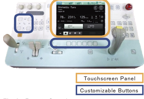
Fig. 8 Remote Console

• Customizable Buttons for Hospital-Preset Use The remote console has 10 customizable buttons and the local console has 8 or 10 customizable buttons that can be configured according to the uses of the hospital, with a resulting substantial increase in examination efficiency. The presence of customizable buttons on an R/F system that is used in a variety of situations is testament to the thoughtfulness of Shimadzu. Since we perform a large number of stomach fluoroscopy examinations and enema examinations at this hospital, many of the buttons have been allocated to inch switching.