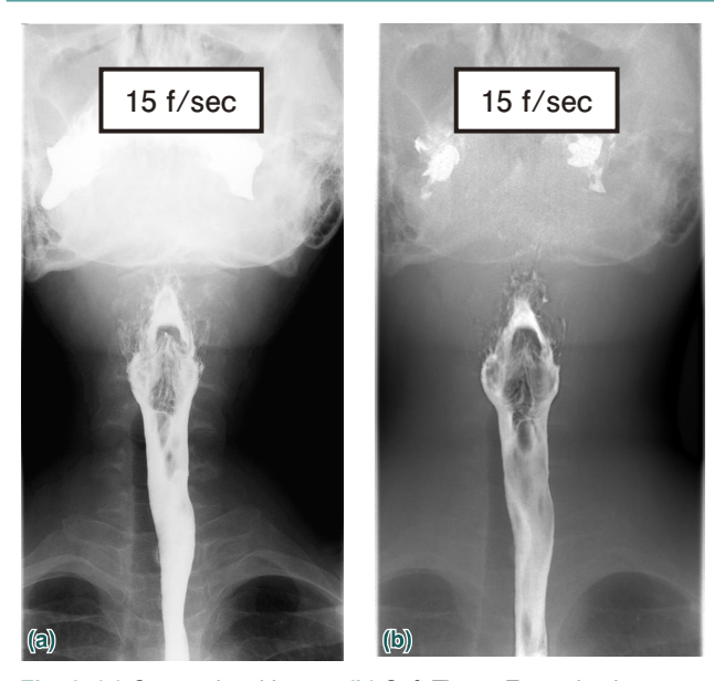
Fig. 6 (a) Conventional Image, (b) Soft-Tissue Extraction Image