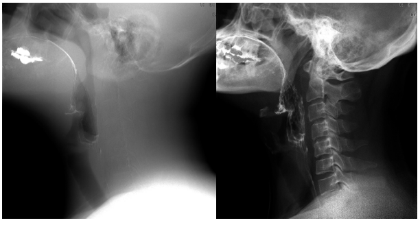
Fig. 1 Soft Tissue Extraction Fig. 2 Bone Extraction