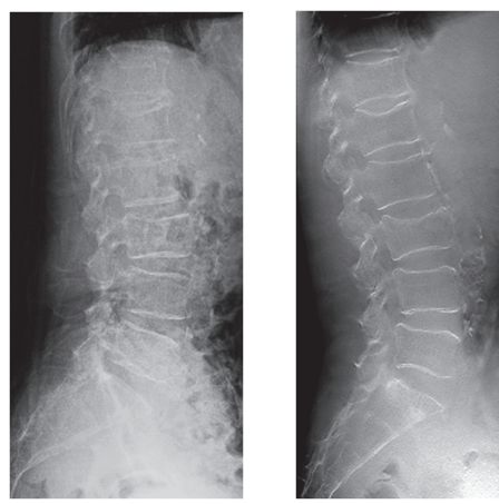
Fig.1 Radiography (Left) and Tomosynthesis (Right) Images of Lumbar Vertebrae

Tomosynthesis, a contraction of the words "tomography" and "synthesis," is an X-ray tomographic imaging method. Conventional film-based tomography has disappeared along with the widespread feasibility of computed tomography (CT), but the advent of flat panel X-ray detectors (FPDs) and digital image processing technologies has triggered a resurgence of interest in tomosynthesis. Key characteristics of the X-ray system we use are to have the ability to perform both radiography and tomosynthesis examinations ( Fig. 1 ), and it allows us to perform 2.5 to 5-second short tomosynthesis is about the same or up to around double the level of radiography, which is approximately 1/10 the dose of CT ( Fig. 2 ).