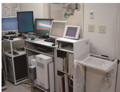
Fig. 4 Radiography Room with Fixed FPD for Standing/Supine Positions Plus General Purpose Wireless FPD Unit