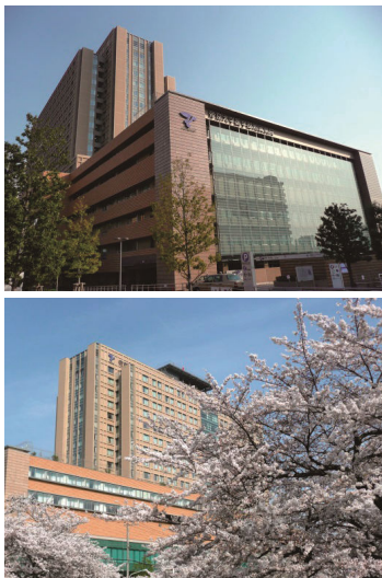
Fig. 1 Teikyo University Hospital

The total number of outpatient visits averages between 1800 and 1900 per day, with an average of 600 to 800 examined by the Department of Radiology per day. The general radiography department examines about 65 % of the patients examined by the Department of Radiology.