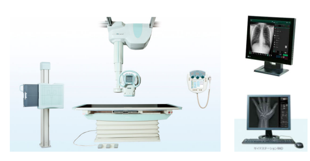
Fig. 1 System External View

Also, the supine radiography table incorporates FPD movability through a wide range, which has expanded the range of supine auto-stitching radiography.