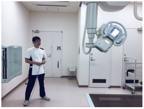
Fig.6 Auto Positioning

Table 2 Auto Positioning X-Ray Tube Movement Times (at Our Hospital)