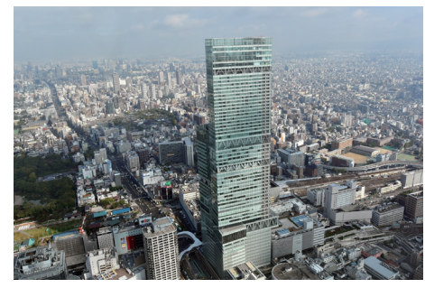
Fig.2 Abeno Harukas Building

9,500 m<sup>2</sup>, architectural area of around 25,000 m<sup>2</sup>, 9 aboveground floors of reinforced concrete (earthquake proof) and 1 floor below ground. The hospital is currently involved in reforming itself based on "organizational strengthening through local medical coordination" and "optimization of hospital function in step with the times," taking place under the philosophy of "Respecting humanity, and providing medical care with humility and sincerity."