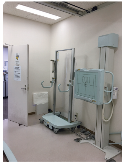
Fig.3 Auto Stitching Radiography Stand

These circumstances led to the introduction of Shimadzu's radiography system for our hospital in March 2015. Although the dedicated radiographic stand is imposing, we had no problem finding space for it in our radiography room (Fig. 3). The instrument moves smoothly and was easy to configure both during radiography and when moving it in front of the stand. The stand has large handles on either side that are sturdy enough for patients to rely on them while mounting and dismounting the stand with ease. The handles are also effective for maintaining posture. Whole spine radiography standards recommend that vertical radiography is performed in a standing position without the use of handles, but at a minimum the handles are a safety feature that helps in maintaining body position. For whole spine radiography, preparing the radiography involves matching the start point to the patient's superior orbital margin, the end point to the patient's groin, then pressing the set button to prompt the X-ray tube and stand bucky unit to automatically align to the radiography start positions. Next, pressing the exposure switch will result in 2 or 3 exposures performed during movement of the bucky unit, and after just 5 seconds the examination