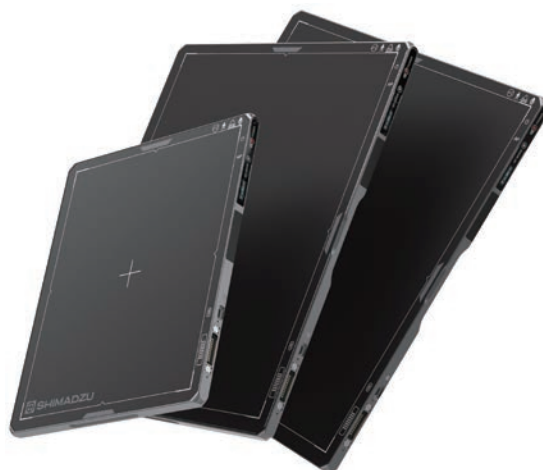
Premium Glass-Free Detectors