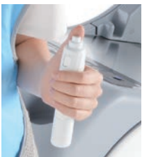
Wireless hand switch

A wireless hand switch or IR remote controller allows you to perform exposures remotely for even easier usability.