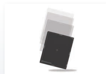
Toughness and Water resistance