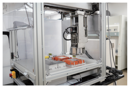
Cell-based Cultured Meat that Simulates the Structure of Wagyu Beef