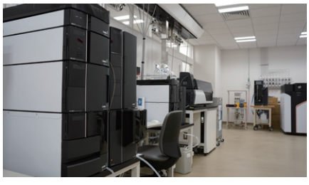
NARO-Shimadzu Testing Laboratory

In 2019, the Shimadzu Group signed a joint research agreement with the National Agriculture and Food Research Organization (NARO) and established the NARO-Shimadzu Kyoto Laboratory for Food Innovation within Shimadzu. In 2022, Shimadzu and NARO established the Self Care Food Council, with Shimadzu serving as the secretariat, with the objective of achieving a society with longer and healthier life expectancies. In 2023, the partnership established the NARO-Shimadzu Testing Laboratory to support the development of healthy foods and beverages. The laboratory assists in verifying the functional benefits and safety of agricultural products and other foods. It also conducts research and development into healthy foods and beverages and promotes their quick adoption in society.