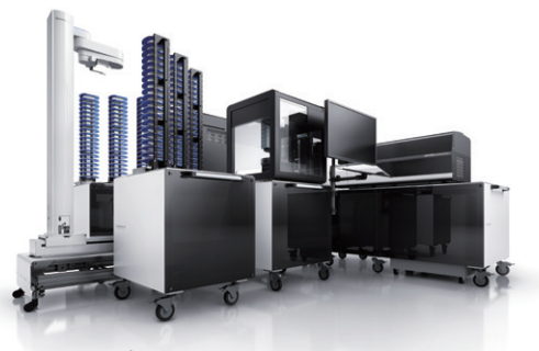
Illustration of Autonomous Lab System

Joint testing with Kobe University has begun to verify the usefulness of a prototype for the world's first "autonomous lab" system based on robotic, digital, AI, and other technologies. Combining biotechnologies with digital technologies will enable a transition from petroleum and natural gas-based manufacturing methods to biotechnology-based manufacturing methods that will lead to phasing out fossil fuels and reduce CO<sub>2</sub> emissions. Shimadzu aims to deploy an autonomous laboratory system, which includes liquid chromatographs (LC) and liquid chromatograph mass spectrometers (LCMS) for the development of biopharmaceuticals, new materials, and so on.