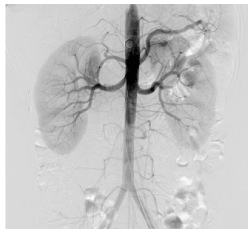
Fig. 5 Angiography of Renal Arteries