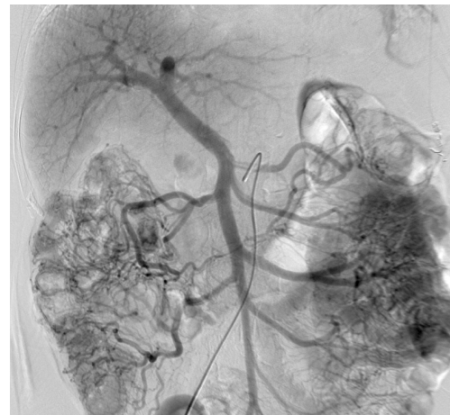
Fig. 4 Angiography of the Portal Vein

In order to minimize exposure to both the patient and the physician, this system also inherits, from earlier products, an "MBH filter", which effectively removes soft X-rays that do not contribute to image quality, and "grid-controlled pulsed fluoroscopy", which eliminates unnecessary X-ray wave tails.