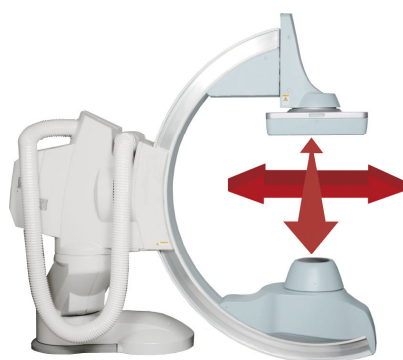
Fig. 3 Parallel Movement of Floor-Mounted C-Arm Support