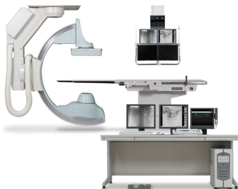
Fig. 1 17" x 17" BRANSIST safire VC17 (Ceiling-Mounted Type)

It is an X-ray angiography system that supports the examination and treatment of blood vessels throughout the entire body, from the head down to the lower limbs. It is primarily used for the abdominal region, for example, in embolization procedures performed to treat liver tumors and gastrointestinal bleeding. It is equipped with a direct-conversion FPD that ensures superior visibility, making it possible to easily observe fine objects, such as peripheral blood vessels and devices used for interventional procedures. Because the FPD has a wide 17-inch field, objects covering a large range can be viewed simultaneously. This makes it possible to reduce the number of times fluoroscopy or radiography needs to be performed, and thereby reduces the burden on the patient (Fig. 1).