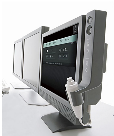
Fig. 7 System Display

We have developed a "system display" X-ray console specifically for angiographic examinations (Fig. 7). It is equipped with various new functions enabling, for example, the automatic aging of the X-ray tube and fluoroscopic density monitoring.