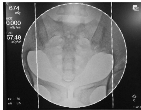
Fig. 6 Virtual Collimation Setting Screen

ACTENO meets the stringent requirements for exposure dose management in the 3rd Edition of the IEC60601 standard.