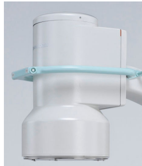
Fig. 2 Handle with C-arm Lock-Release Button

An optional handle with C-arm lock-release button is available at the I.I. side to exploit the benefits of the fully counterbalanced OPESCOPE manual positioning. It allows the operator to temporarily release the C-arm lock to position the C-arm as required (Fig. 2).