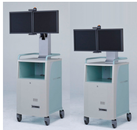
Fig. 3 Monitor Cart Vertical Movement Adjustment Mechanism

The image stability is also improved. To maintain constant system sensitivity and minimize the effects of noise, sophisticated control circuitry has been added to the Image Brightness Stabilizer (IBS) that automatically controls the X-ray conditions. In addition, the Auto Window Level Control (AWC) function performs realtime