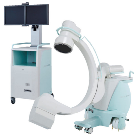
Fig. 1 OPESCOPE ACTENO