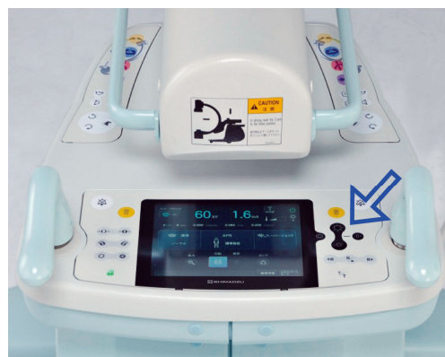
Fig. 5 Brightness Buttons

The system also permits density adjustment to match the user's preferences by push-button operation. The brightness buttons added to the C-arm cart operating console allow rapid adjustment of the density in seven steps from -2 to +4 (Fig. 5).