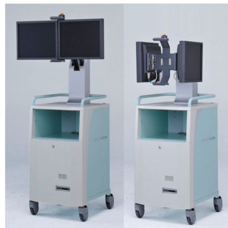
Fig. 4 Monitor Cart Folding Mechanism

processing according to the pixel value histogram of the displayed image to automatically adjust the image gradation and display images with stable density.