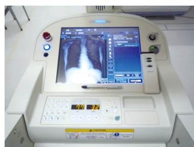
Fig. 5 Operation Panel

In general radiography, the method of creating X-ray images has evolved from an era of using a combination of film and automatic developer, to using a CR system with laser imager, and now to an FPD with an image viewer. Until only a short time ago, no one imaged such an amazing environment would exist, where images acquired with an FPD in the radiography room could be viewed within three seconds and images sent from the X-ray system could be viewed via a viewer by any medical worker in the hospital within 10 seconds. The same applies to images acquired using the mobile X-ray system as well. Everyone remembers how discouraging it was to scurry around from ward to ward to acquire one exposure at a time, return to the radiography room to develop the images, and then find out the radiographs were too dark or too light (though that mostly stopped after we introduced the CR system) or that the area being examined did not appear in the image, so that we had to go acquire another exposure. I'm sure any technologist at the time would have loved this mobile X-ray system, which allows viewing images within only a few seconds after exposure. Because the position of IVH (intravenous hyperalimentation) and stomach tubes can be verified immediately on the spot, it allows repositioning them immediately as well, so doctors and nurses have been very pleased (Fig. 5).