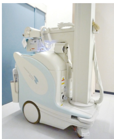
Fig. 3 MobileDaRt Evolution