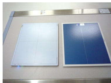
Fig. 4 Left: CXDI-70C Right: Grid Frame