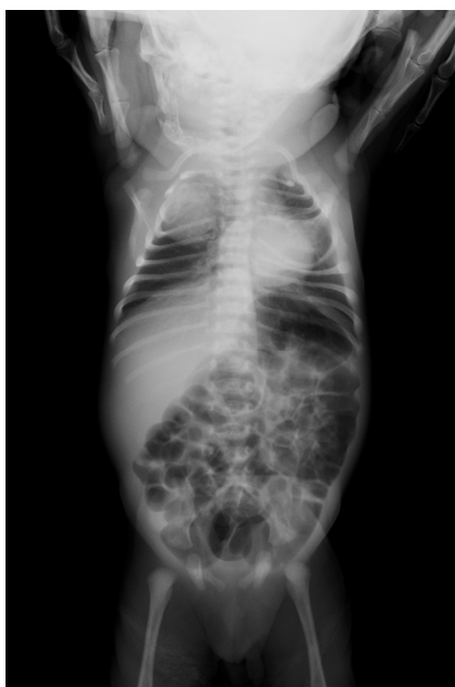
Fig. 7 Case 4

This case did not have a high level of urgency, but it illustrates how a single chest X-ray can have significant consequences. In this case, an infant admitted for jaundice was observed to have a small hard protrusion on the precordial region since birth, so the attending physician obtained a chest X-ray, which revealed a suspected intrathoracic tumor on both sides (Fig. 7). Therefore, the case was transferred to the neonatal surgery department at a general perinatal center. Though we were hesitant to expose an infant without a significant respiratory disorder or thoracic deformity to the radiation from a chest X-ray, we felt it was worthwhile in this case, because of the difficulty in rendering chest cavity images adequately with an ultrasound examination.