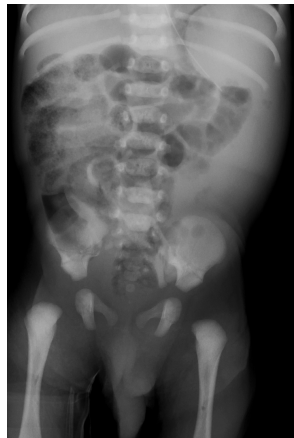
Fig. 6 Case 3B