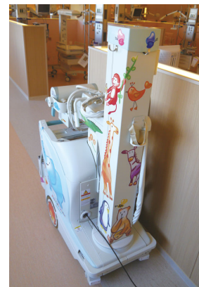
Fig.1 MobileDaRt Evolution

even with better treatment methods and better medical equipment now available, when faced with an emergency, we are acutely reminded how conventional radiography still is extremely important for imaging. In particular, mobile X-ray systems required time for processing. Therefore, during an emergency, the time delay would make us feel impatient waiting for the images. That is why our hospital introduced a Shimadzu MobileDaRt Evolution unit (Fig. 1) equipped with a compact FPD, which enables obtaining images inside incubators, in our pediatrics department, when the NICU moved to a new building in April 2011. This has also been useful for neonatal care, as described in the cases below.