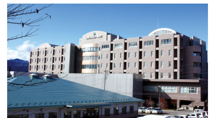
Fig. 2 International University of Health and Welfare Hospital

The center of perinatal care in Tochigi prefecture is the general perinatal care center for Jichi Medical University Hospital and