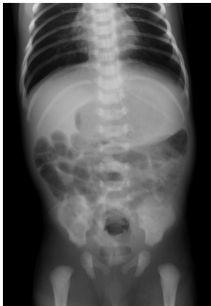
Fig. 5 Case 3A

However, the free-air in infants weighing less than 1000 grams is small and difficult to see. Based on our experience, this requires multiple X-rays. If this can be determined while the images are being obtained, then the patient can be moved to an appropriate position for imaging.