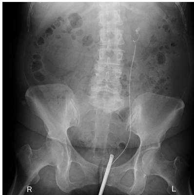
Fig. 7 KUB Image

The previous method of stent placement and replacement in cases such as this involved manipulating the catheter while alternating between viewing fluoroscopic images and endoscopic images. With the G4, these images can now be viewed simultaneously on the same screen, which allows