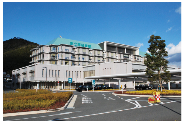
Fig. 1 View of Nishiwaki Municipal Hospital

The current hospital is an entirely new building of which construction started in March 2004 and its grand opening occurred in November 2009 ( Fig. 1 ). In the new hospital, the patient records are digitized, and with each year the hospital has come to play an increasingly large role as a key hospital for the coordination of regional cancer treatment and as a support hospital for regional medicine. This has resulted in the services Nishiwaki Municipal Hospital provides becoming indispensable to northern Kita-Harima.