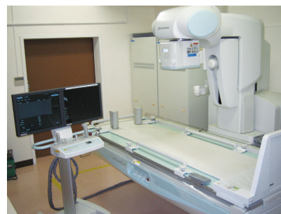
Fig. 3 SONIALVISION G4

the visibility of subtle, pale contrast of contrast media as well as the increasing employment of endoscopy for various purposes and increasing use of fluoroscopic recording for swallowing imaging. High-definition fluoroscopic images have also become an effective tool for recognizing subtle lesion changes during stomach radiography examinations and enema examinations. Improvements in fluoroscopic image quality, as well as shortened examination times, have been essential in improving the quality of medical care at this hospital. Nevertheless, it would be short-sighted to focus only on image quality and result in increasing exposure dose. Having given both these requirements equal concern in choosing the model of system, because of the substantial noise reduction achieved during fluoroscopy and radiography examinations resulting in lowered exposure dose and improved image quality and because of the safety of use, we chose the Shimadzu SONIALVISION G4 ( Fig. 3 ).