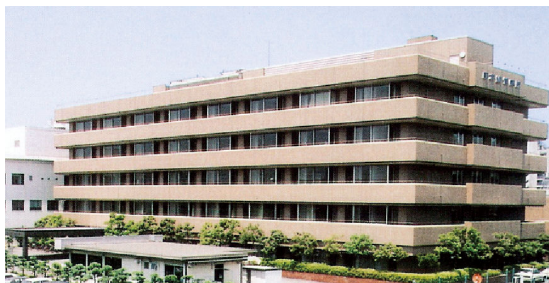
Fig. 1 External View of Nihon Koukan Hospital

When Nihon Koukan Hospital ( Fig. 1 ) was founded in 1937, it was the first general hospital in Kawasaki City, Kanagawa Prefecture. The Koukan Clinic ( Fig. 2 ) was established in October 2003 as part of the Nihon Koukan Hospital. The hospital is visited by around 1,100 outpatients every day and has 395 beds (45 for convalescent care). It plays the role of a central, community-based hospital, working in cooperation with local hospitals and clinics, and acting on the fundamental principles of the Koukan Association: "medical care that is holistic and patient-centered," "medical care delivered with sincerity," and "medical care firmly rooted in the local community."