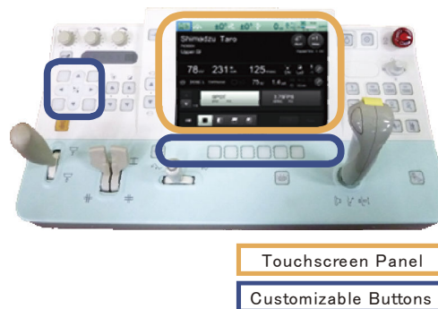
Fig. 8 Remote Console

The remote console has 10 customizable buttons and the local console has 8 or 10 customizable buttons that can be configured according to the uses of the hospital, with a resulting substantial increase in examination efficiency. The presence of customizable buttons on an R/F system that is used in a variety of situations is testament to the thoughtfulness of Shimadzu. Since we perform a large number of stomach fluoroscopy examinations and enema examinations at this hospital, many of the buttons have been allocated to inch switching.