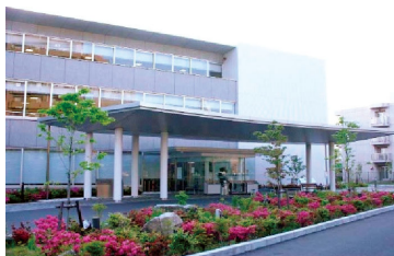
Fig. 2 External View of Koukan Clinic