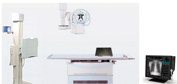
Fig. 1 RADspeed Pro V4 System

The key components and specifications of a typical system are indicated in Tables 1 and 2.