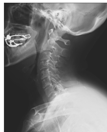
Fig. 6 Side View of Cervical Spine