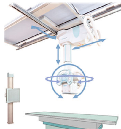
Fig. 8 Auto Positioning

The X-ray grid can be manually removed from the stand or table for radiography of children or extremities. Removing the grid allows obtaining images using lower exposure dose levels.