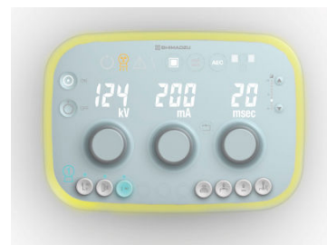
Fig. 3 Mini-Console

This improves ease-of-operation by using dials and buttons to set X-ray exposure parameters and improves visibility by using light to indicate the status ( Fig. 3 ).