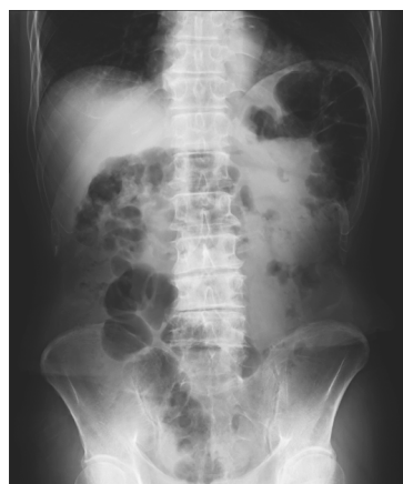
Fig. 5 Front View of Abdomen