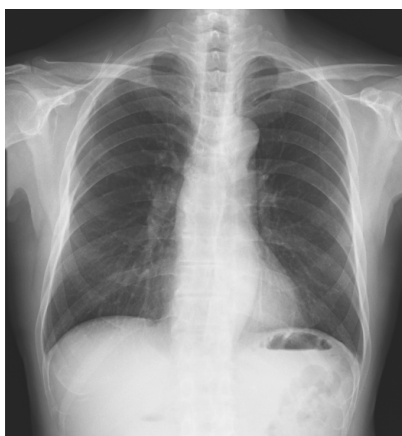
Fig. 4 Front View of Chest

Examples of images obtained using the image processing features described in (1) to (4) are shown in Fig. 4, 5, and 6.